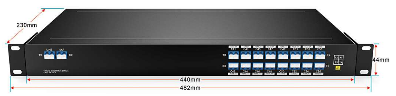
19" Inch 1U Rack